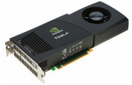
The NVIDIA Graphics Processing Unit (GPU): turns your laptop into a supercomputer

the chip, but it uses standard coding languages, such as C. "We stick to the language standards everyone knows," says Mr Keane.